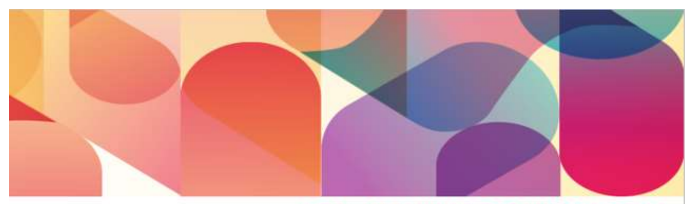
APA ANNUAL CONVENTION August 3-6, 2017 | Washington, D.C.

11:00AM - 11:50AM Symposium: Advancing Vocational Psychology Through Positive Psychology and Cross-Cultural Lenses Convention Center/Room 156 Street Level